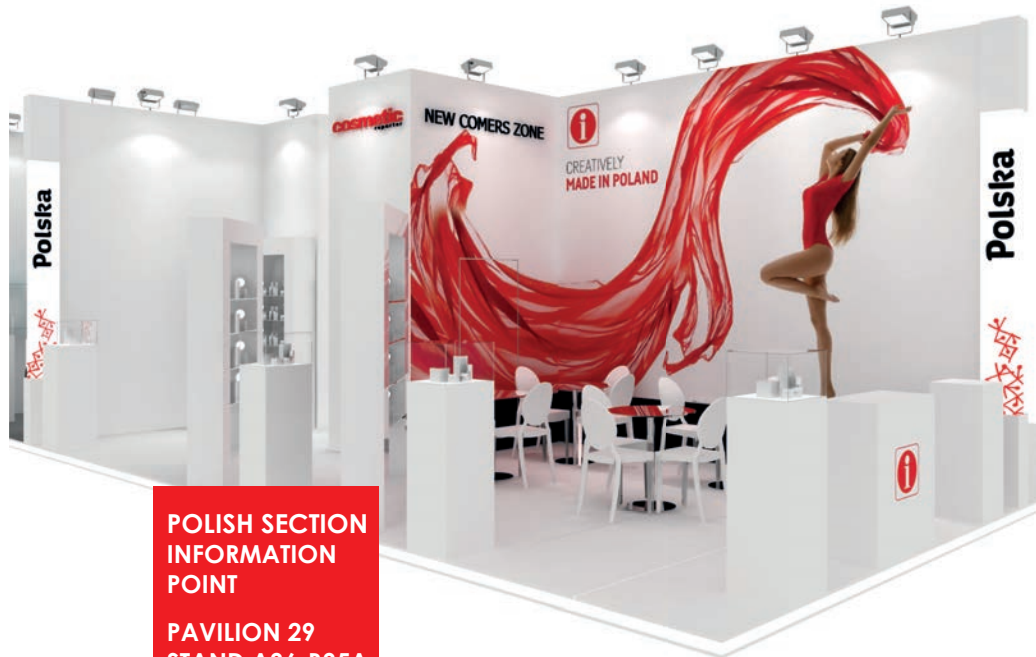
POLISH SECTION INFORMATION POINT PAVILION 29 STAND A36-B35A