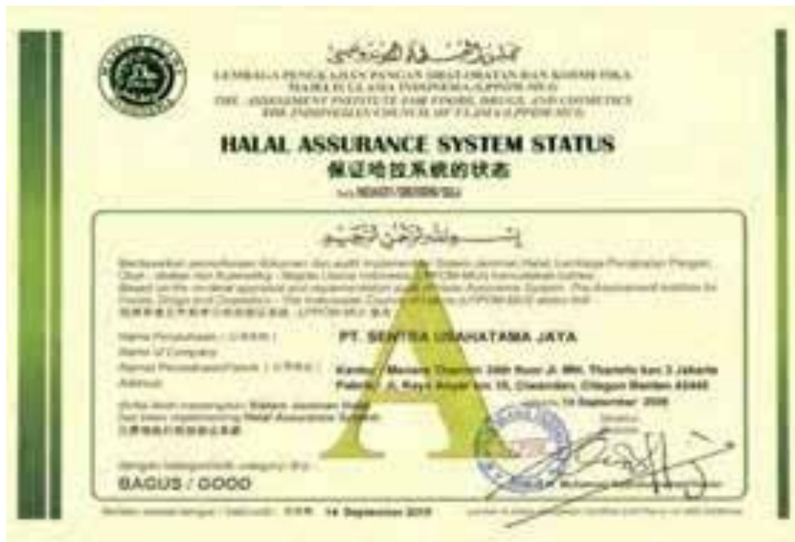
HAS Implementation Status

a written fatwa issued by MUI to state the halalness of a product